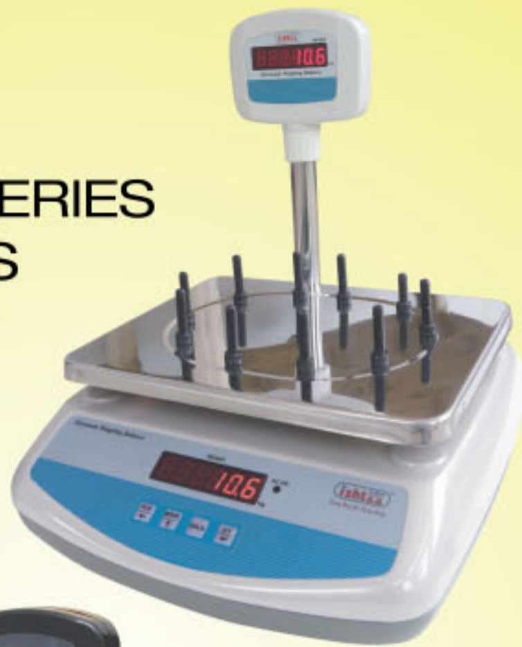
V SERIES ABS