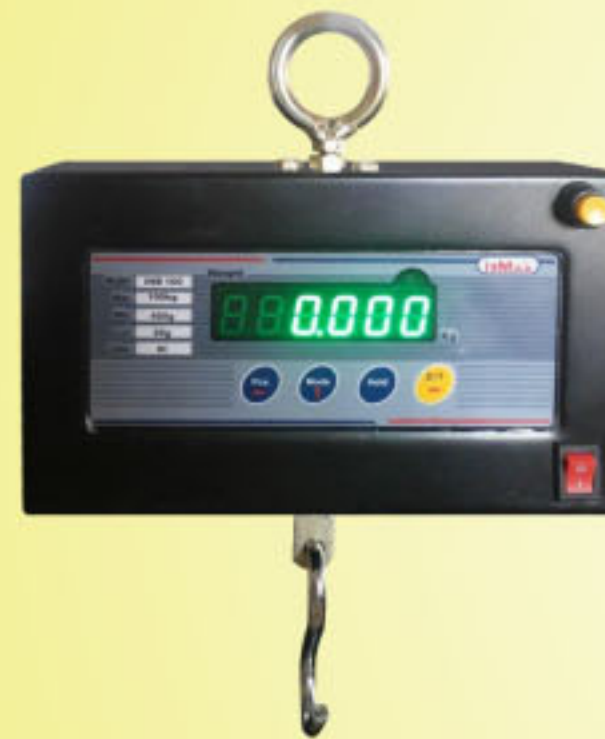
Metal - Rear Display